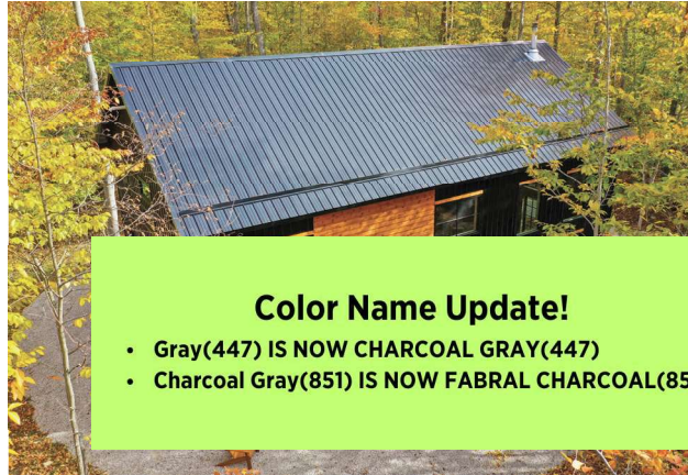
PEWTER GRAY 454